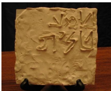
Shema & Tallit

Consider taking your lesson with you & review it during your lunch.