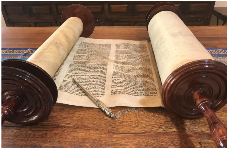
Congregation Faithful Stewardship Torah Scroll. (Written in Romania, circa 1936, during the rise of extreme anti-Semitism which led to WWII and the Holocaust.)